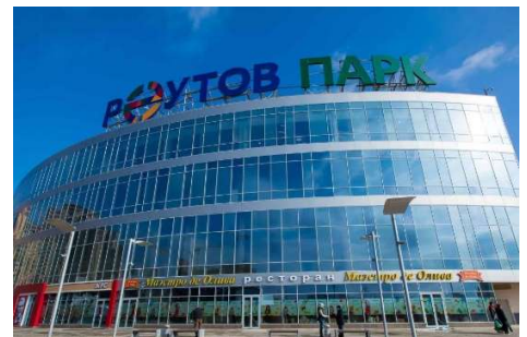
Reutov Park Shopping Centre