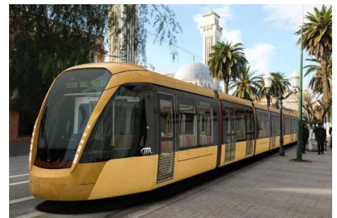
Sidi Bel Abbes Tramway