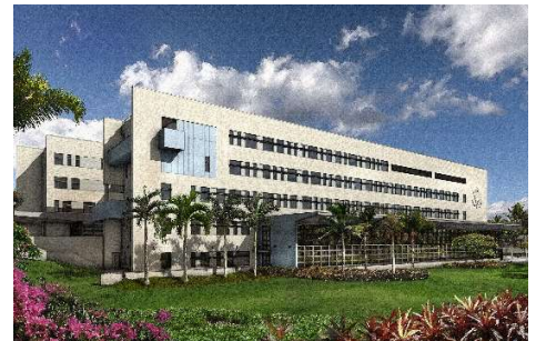
American embassy, Dominican Republic